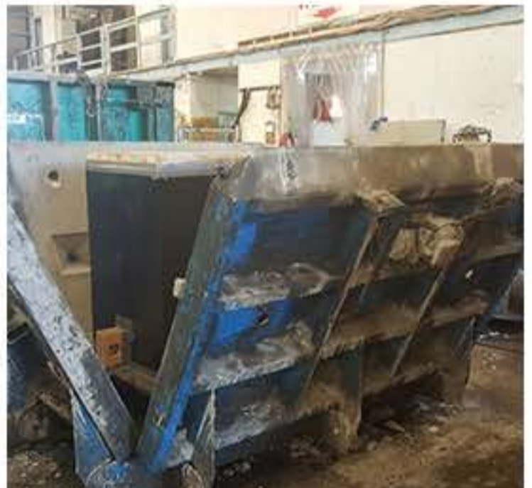
Concrete Form Jacket Pour