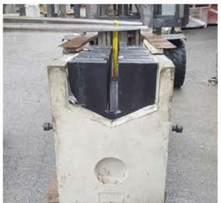
Removal of Precast Pouring Support