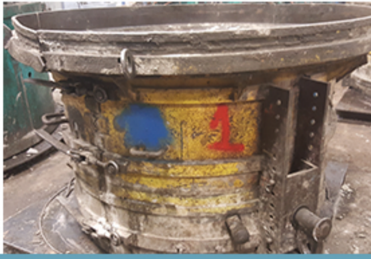
Concrete Form Jacket Pour