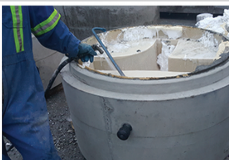
Removal of Precast Pouring Support