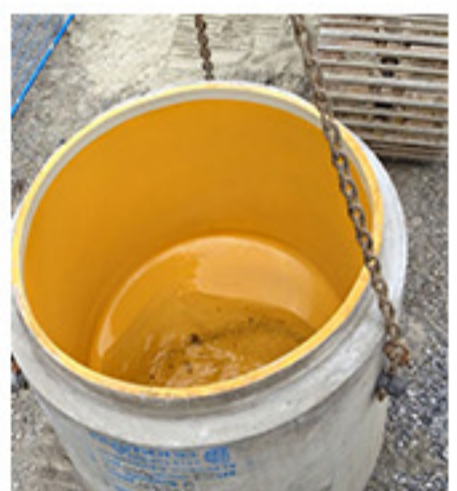
BHR Pump Station Capilano Suspension Bridge [North Vancouver]