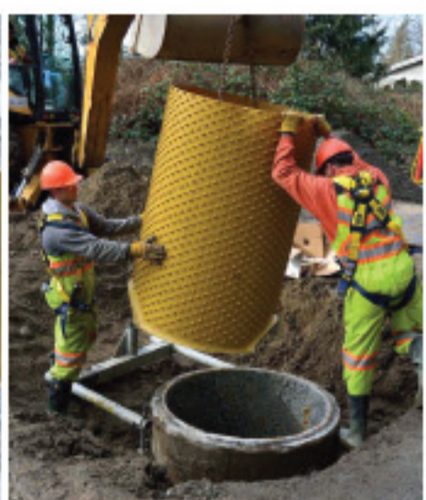
Manhole Rehabilitation Project [Abbotsford]