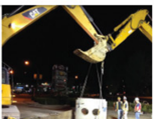
Coquitlam City Centre Gravity Sewer Upgrade [Coquitlam]