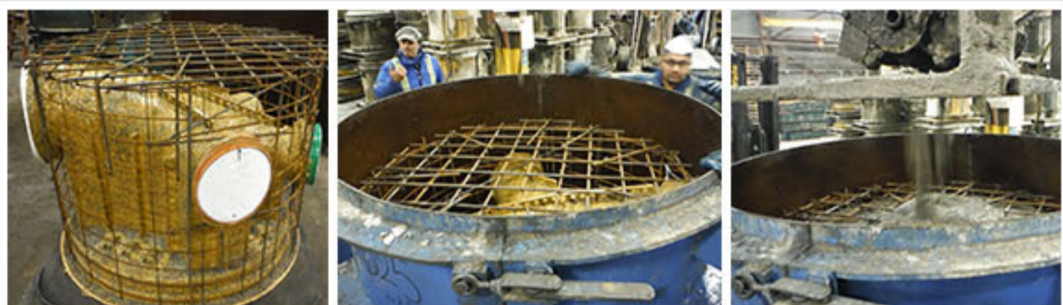
Reinforcement | Concrete Form Jacket | Pouring