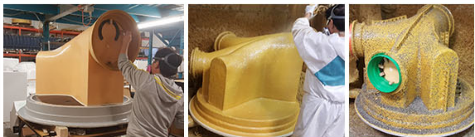
Monobase Set-up | FRP