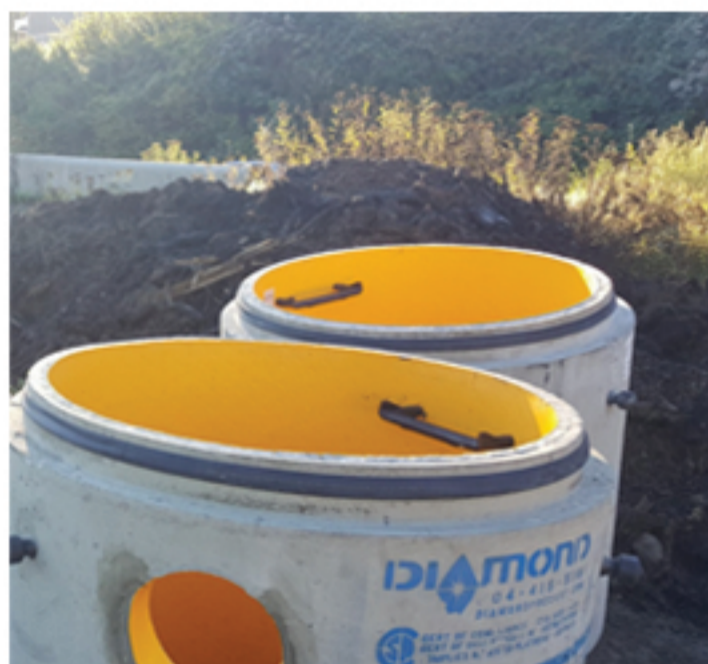
w/ Ladder Rungs Inserts