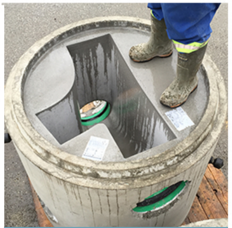
Unlined Stormwater Solutions