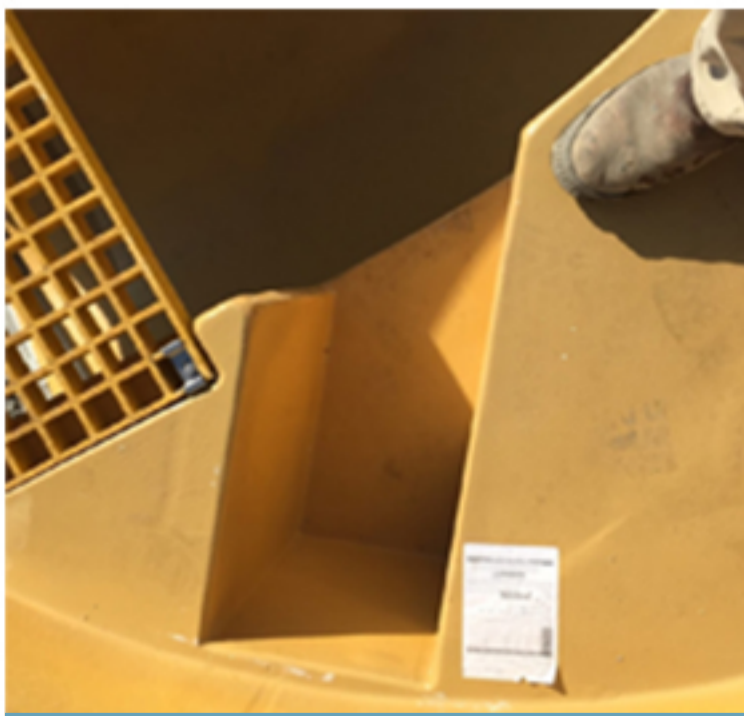
Fully Lined Sanitary Solutions